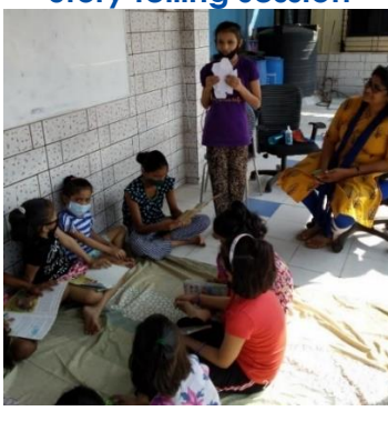
Story telling session

At BKF we conduct debate and story telling sessions for the students.